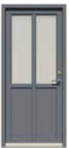
Two top lights and 2 bottom panels