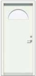
Plain with half round glass