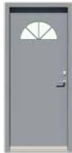
Plain with farmhouse glass