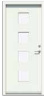
Plain with square multi lights