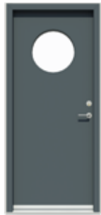
Plain with round glass