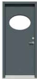
Plain with oval glass