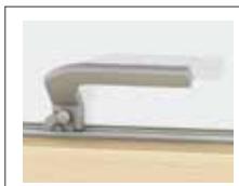
Espagnolette with child-lock