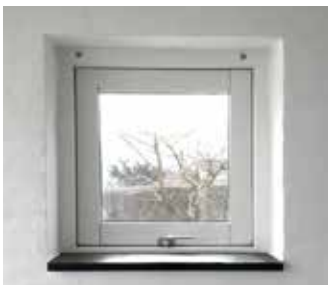
➤ Conventional window