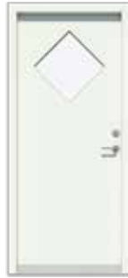
Plain with diamond light