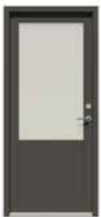
Glazed door with 1 panel