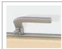
Espagnolette with lock