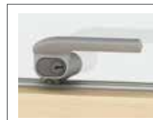
Espagnolette with cylinder lock

All espagnolettes can be supplied with a lock and key for extra security or with a child-lock button.