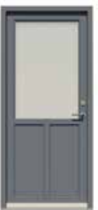
Glazed door with 2 bottom panels