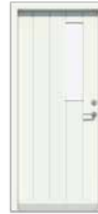
Vertical with small rectangle glass