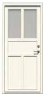
Two top lights and bottom panels