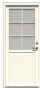
Top multi lights and one bottom panel