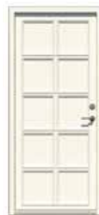
Multi lights door