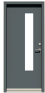
Plain with long rectangle glass and kick plate